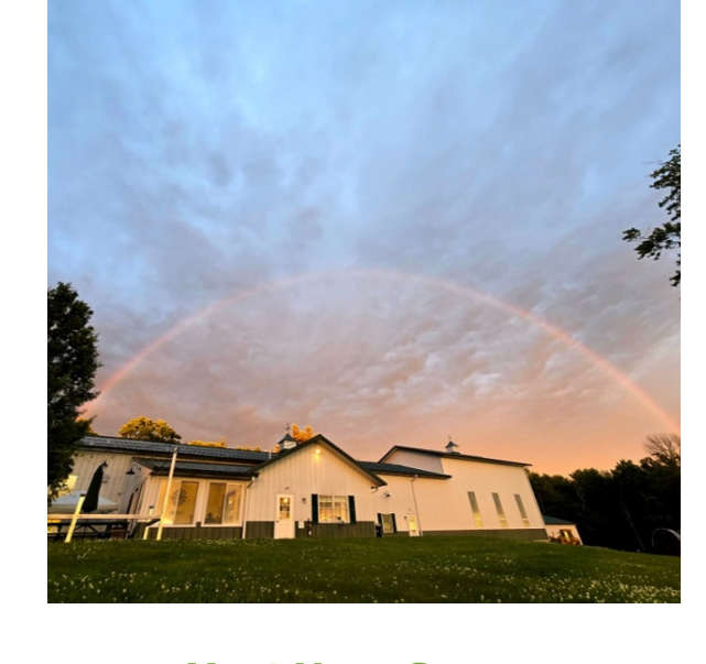
Summer Story Walk