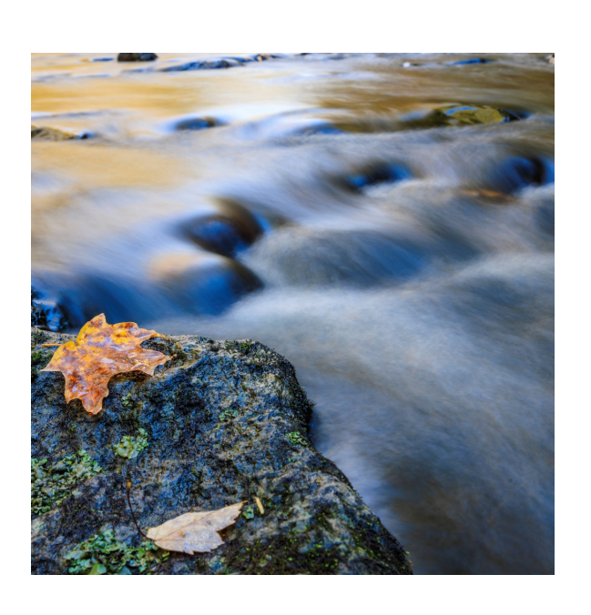
Two-Eyed Seeing Presented by Institute for American Indian Studies Saturday, October 5 10 AM to 12 PM