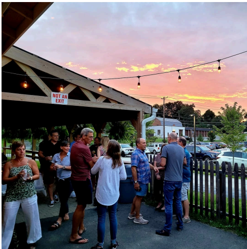
Meet Your Greens Thursday, May 30 5 PM to 7 PM