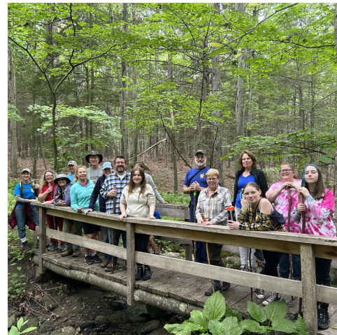
CT Trails Day Saturday, June 1 10 AM to 12 PM