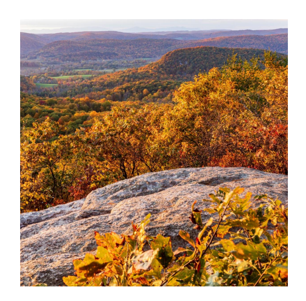
Housatonic Heritage Hike September 23 Kent