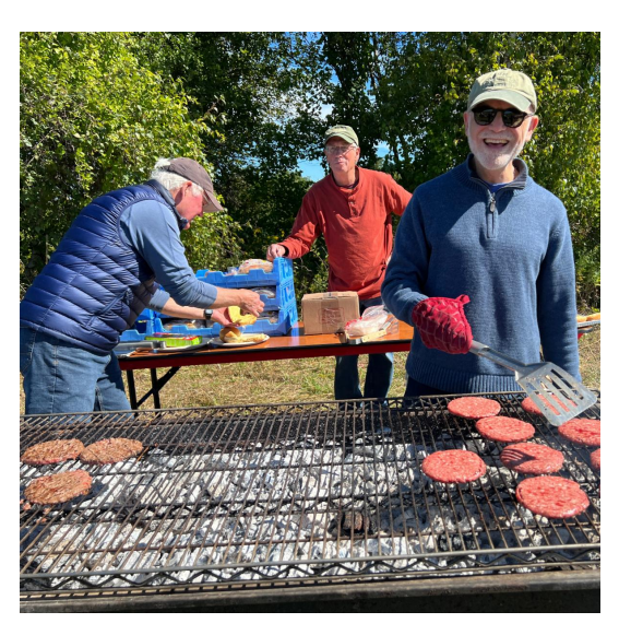
Annual Picnic September 30 Kent