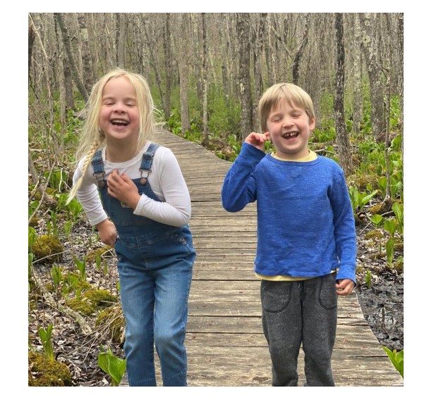
Story Walk at the Mallory Preserve