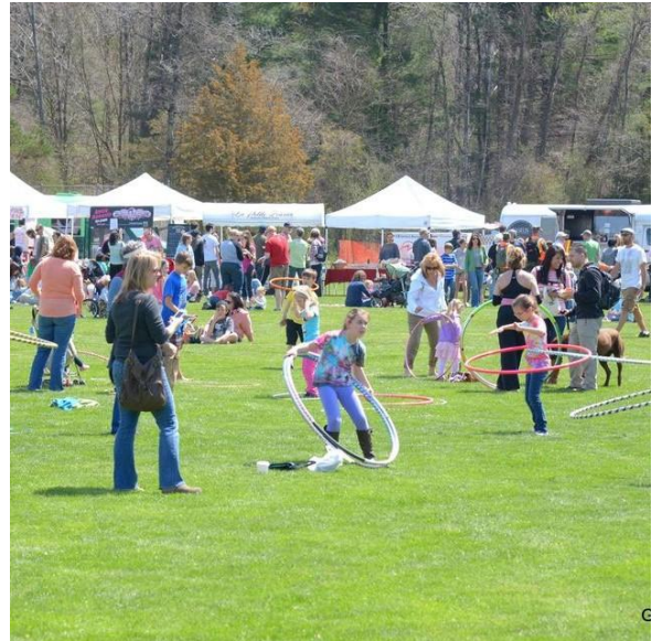
Woodbury Earth Day April 29