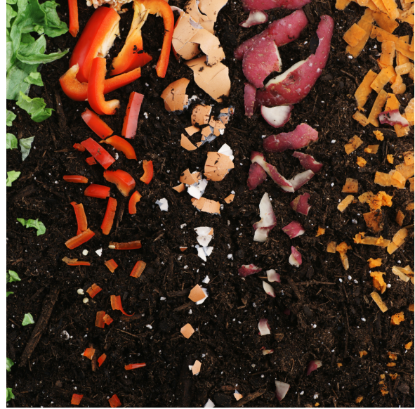
The Great Big Day of Composting April 22