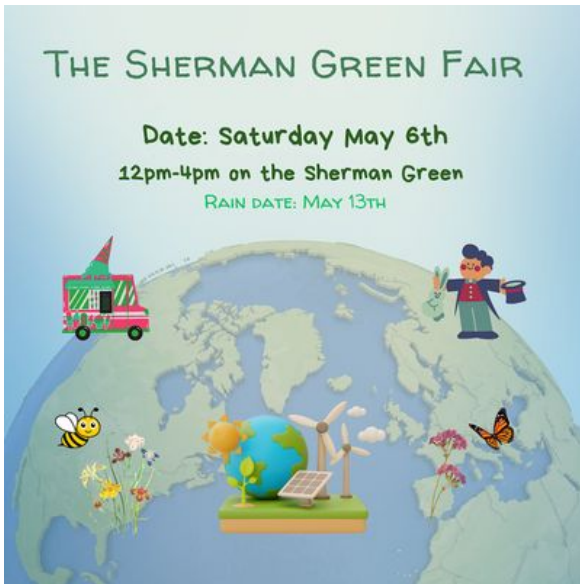
Sherman Green Fair May 6