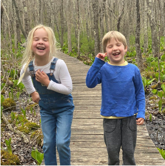
Spring Break Story Walk April 10 to April 25