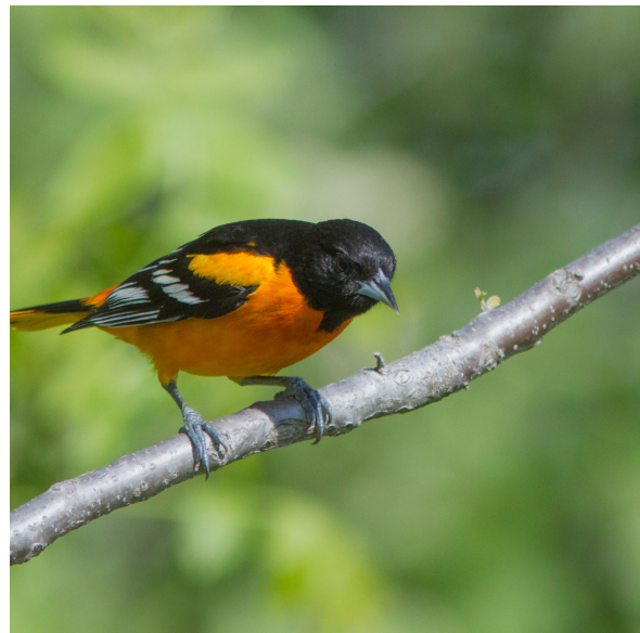
Smyrski Farm Bird Walk May 6