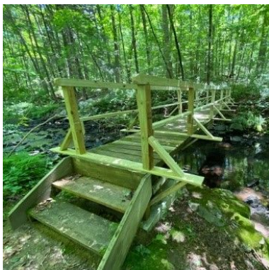
New bridge railings at the Kahn Preserve