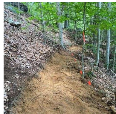
New looped trail at the Alice McCallister Preserve

Each year NCLC welcomes summer Land Stewards for a paid 10-week program to advance their education and career opportunities in conservation. Our Land Stewards care for our public nature preserves and working farms, provide stewardship support to partner land trusts, and participate in educational, technological, and scientific trainings and activities.