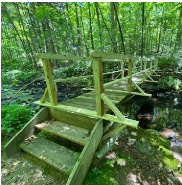
New bridge railings at the Kahn Preserve