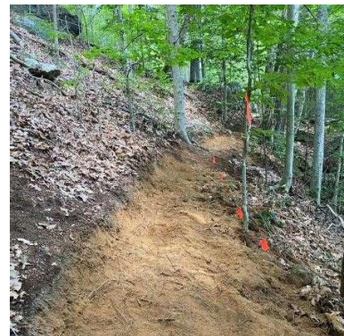
New looped trail at the Alice McCallister