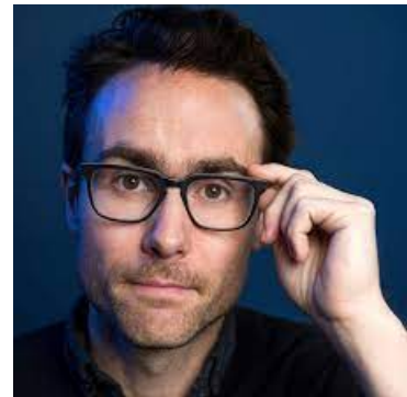
David Wallace-Wells Journalist and author of the best-selling book The Uninhabitable Earth