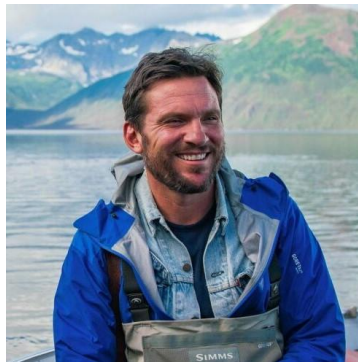
Bill Weir CNN correspondent and the creator of the global documentary series The Wonder List with Bill Weir