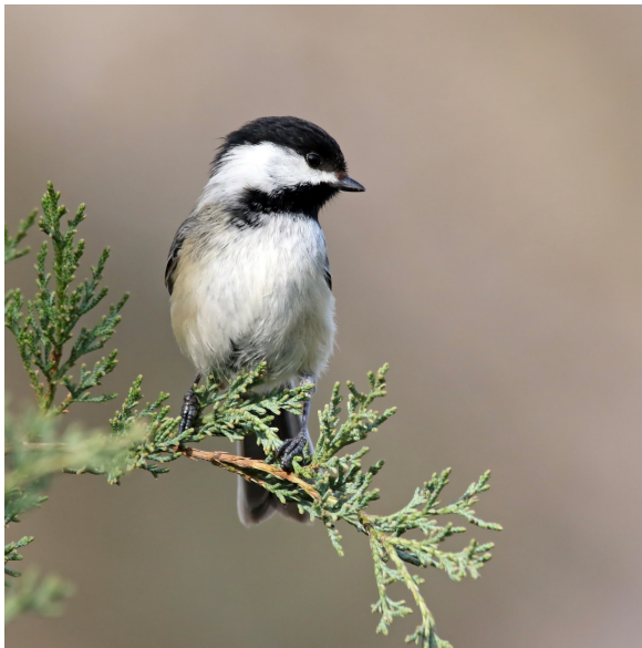
Video Recording: How Your Yard Can Help Birds

Click below to watch recordings of our recent events. You can also visit our website for all of our videos.