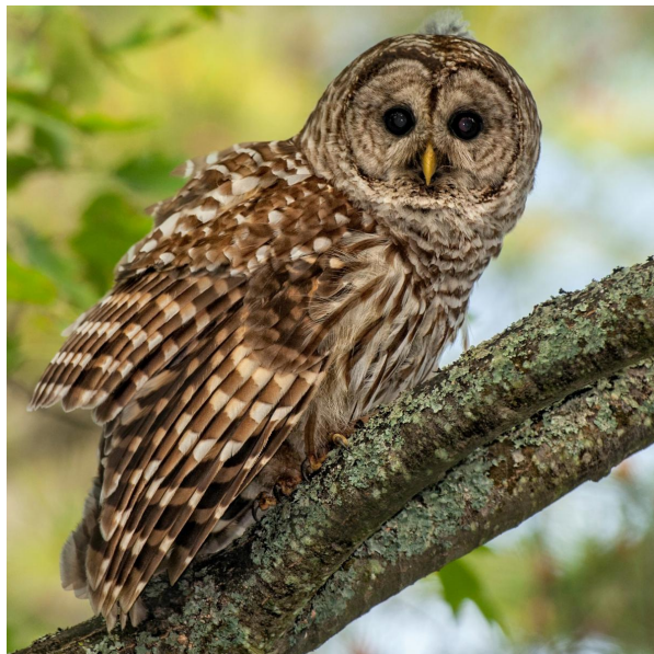
Owl Prowl February 21