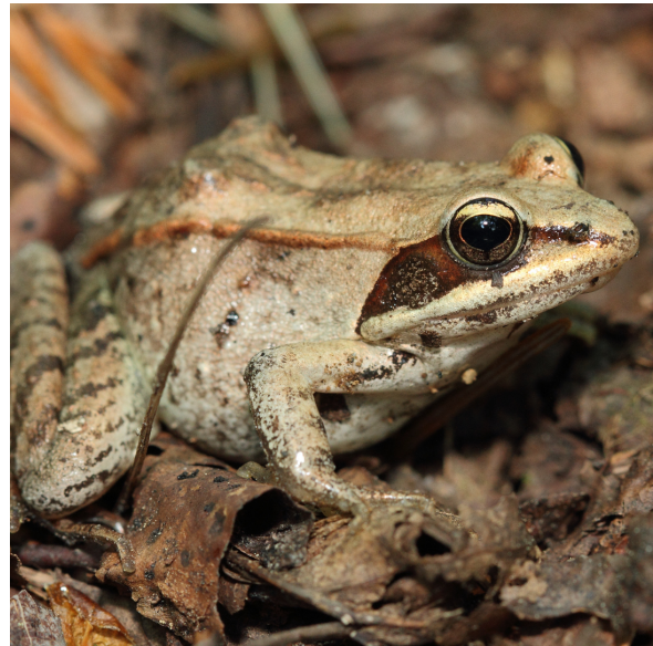
March 2022 Frog Frolic at Towner Hill Click to Register