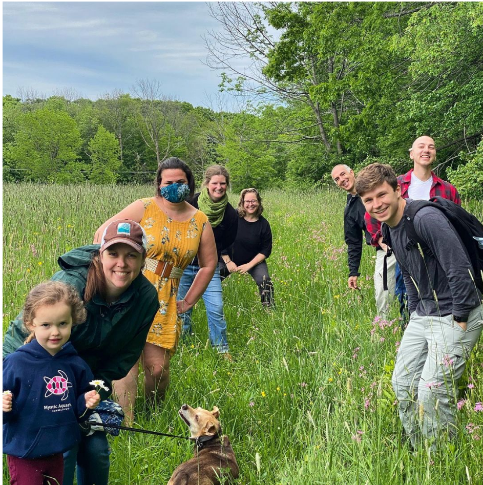
NCLC staff on a hike at the Hauser Preserve in Litchfield.

Northwest Connecticut Land Conservancy is a nonprofit regional land trust and the largest land trust in the state. As a guardian of natural and working lands, public recreation areas, and drinking water resources, NCLC permanently protects 12,645 acres (and growing) of vast, connected natural areas in Litchfield and northern Fairfield Counties.