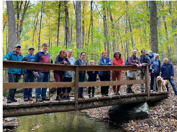
Mallory Preserve Hike