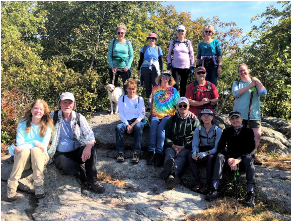
Cobble Mountain Hike

We had a wonderful time on our guided hikes this fall at Cobble Mountain and the Mallory Preserve. Tag us in your triumphant summit pictures @nwctconservancy on Instagram and Facebook . We hope to see you on the land soon!