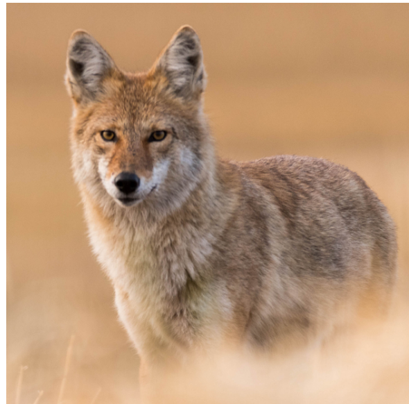
Video Recording: Wildlife Cameras 101