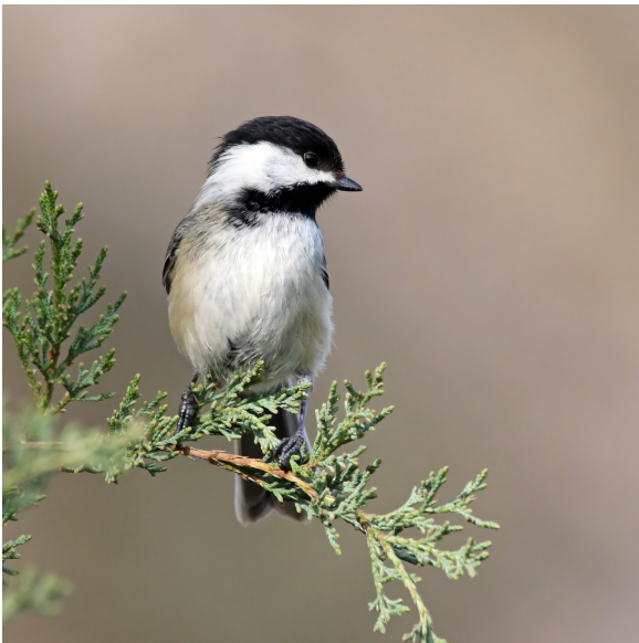
Video Recording: How Your Yard Can Help Birds

Click below to watch recordings of our recent events