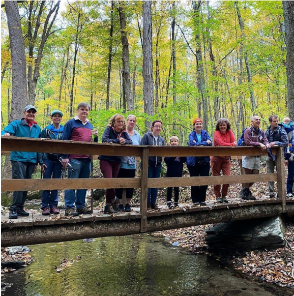
June 4 CT Trails Day Mallory Preserve Sherman