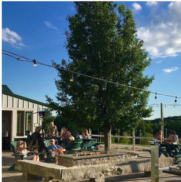
Meet Your Greens Norbrook Farm Brewing September 21