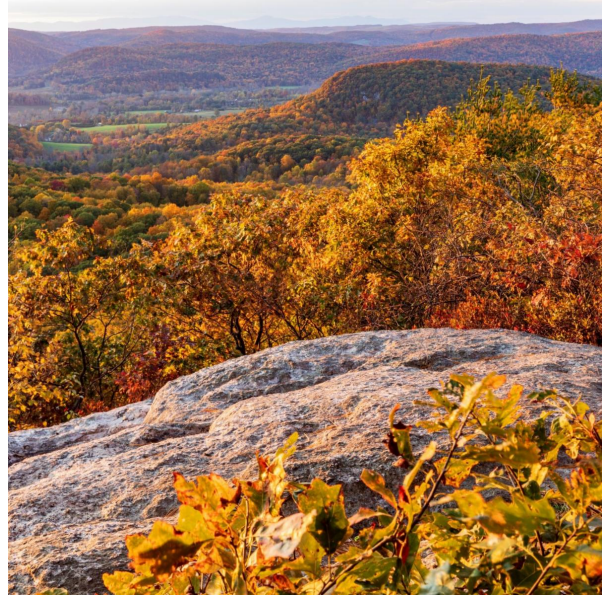
Housatonic Heritage Hike Cobble Mountain September 10