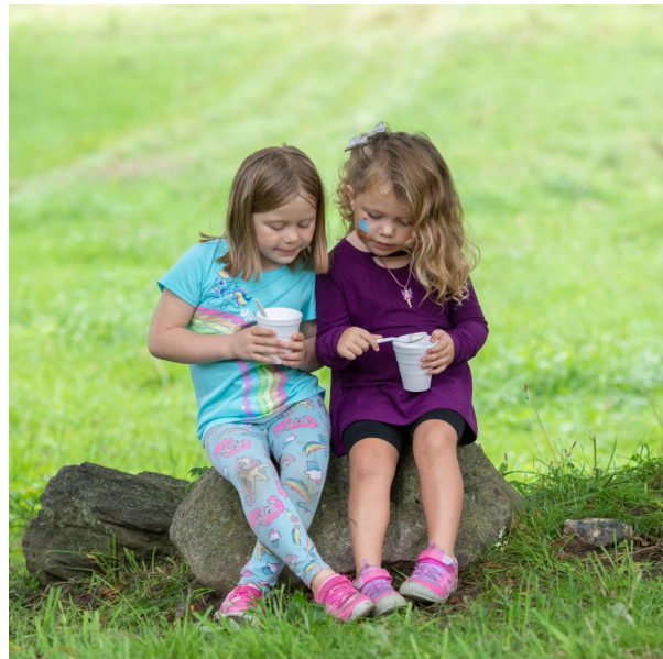
Annual Picnic Hadlow Preserve September 24