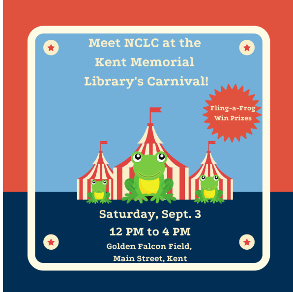
Kent Memorial Library Carnival Main Street, Kent September 3