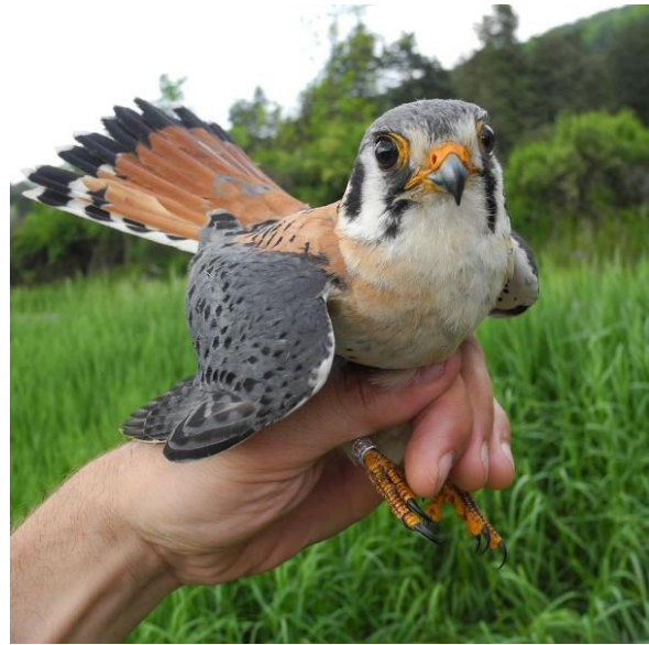
May 15 Bird Walk Smyrski Farm New Milford