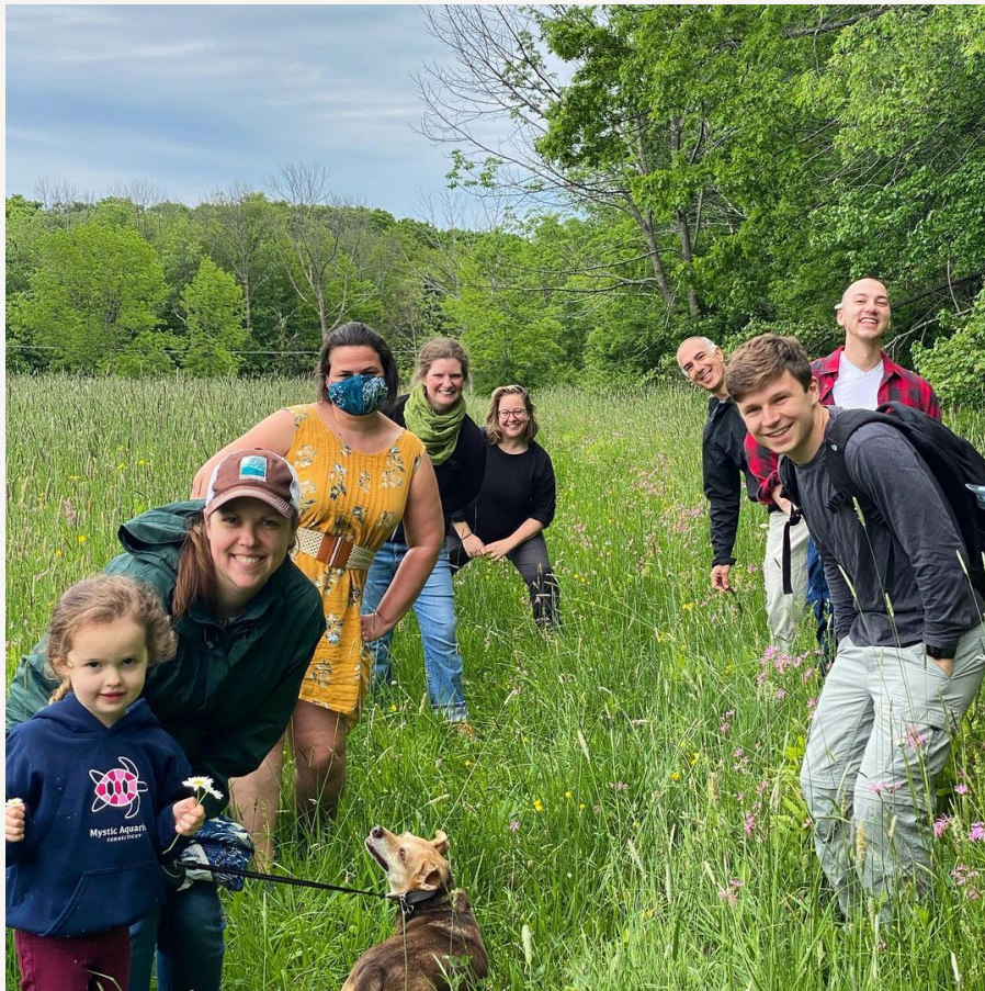
NCLC staff on a hike at the Hauser Preserve in Litchfield.

We are hiring a Program Administrator. The Program Administrator works with the Executive Director and other staff to support NCLC's administrative, financial, and communication needs. This is an equal opportunity, part-time, non-exempt position located in Kent, CT. Please click here to read the full job description. Send inquiries to work@ctland.org .