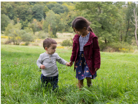
The Changing Climate May 19