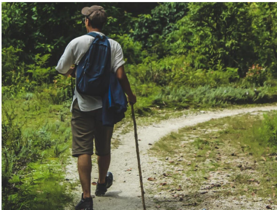
Virtual Tour of Weantinoge's Hiking Preserves May 7