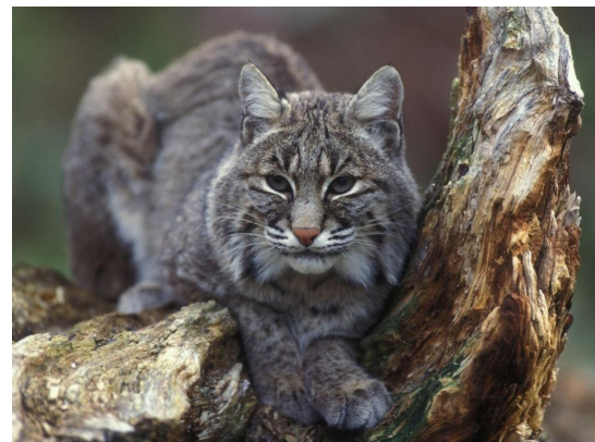
Bobcats in Connecticut May 21