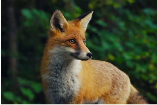
Wild Cousins of Our Best Friends: Wolves, Coyotes, and Foxes Friday, February 14