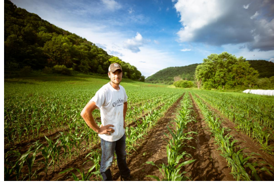
Litchfield County Farmland Mixer Thursday, February 20