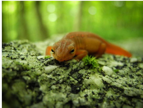
Mount Tom Preserve

Weantinog Heritage Land Trust is Northwest Connecticut's regional land trust and the largest land trust in the state. As a guardian of natural and working lands, public recreation areas, and drinking water resources, Weantinog permanently protects 10,500 acres (and growing) of vast, connected natural areas in Litchfield and northern Fairfield Counties.