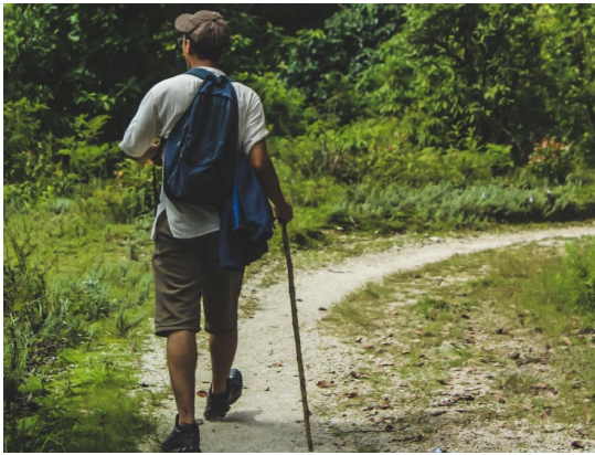
James Morrissey Preserve