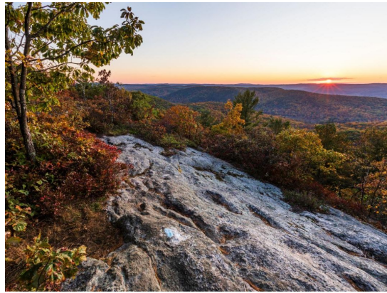
Cobble Mountain and Macedonia State Park