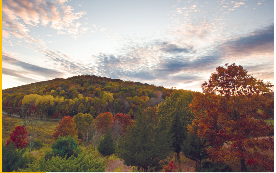
Cobble Brook Vista Preserve, Kent