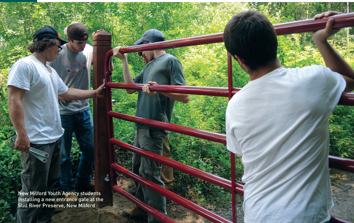
New Milford Youth Agency students installing a new entrance gate at the Still River Preserve, New Milford