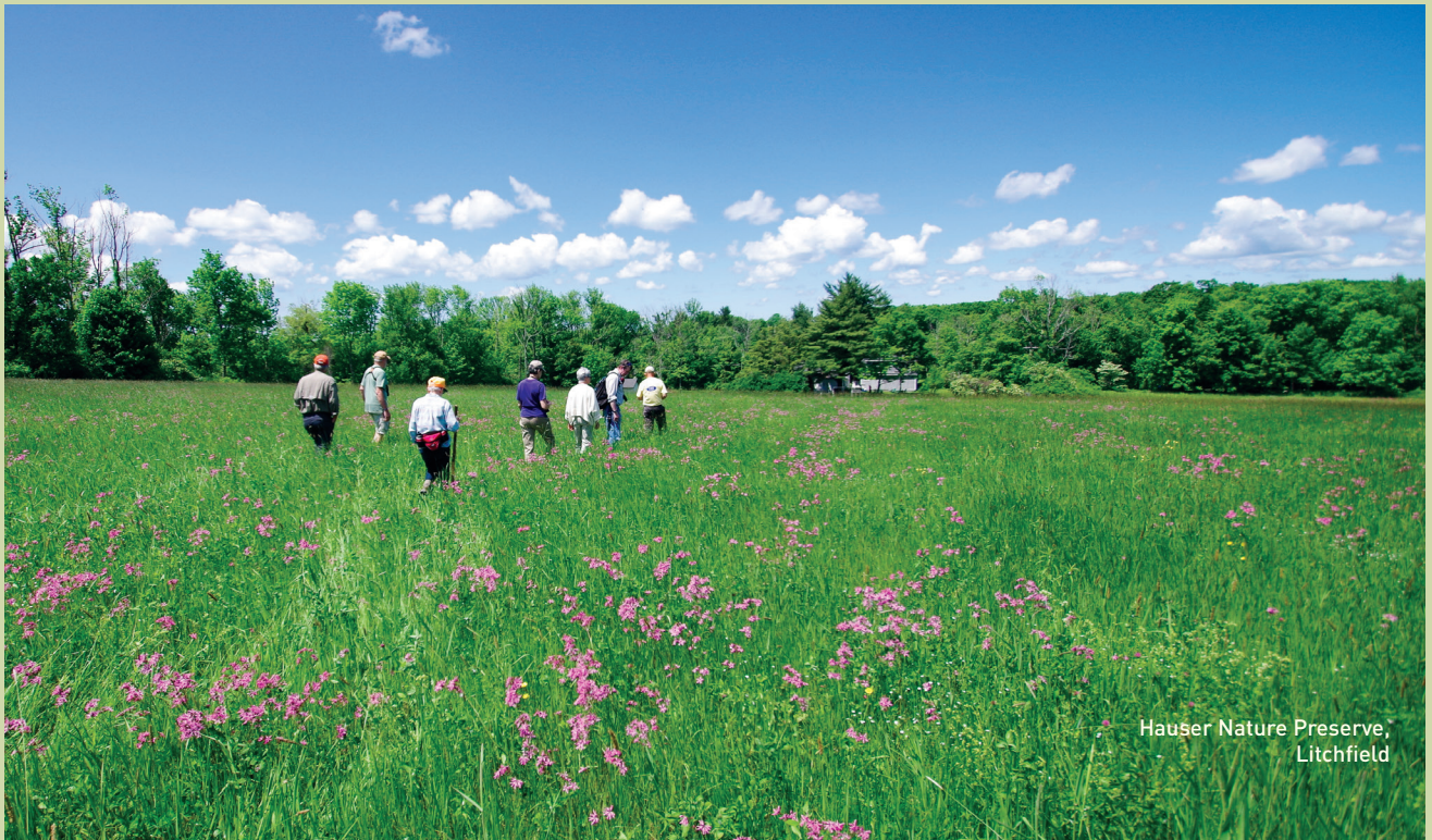
Hauser Nature Preserve, Litchfield