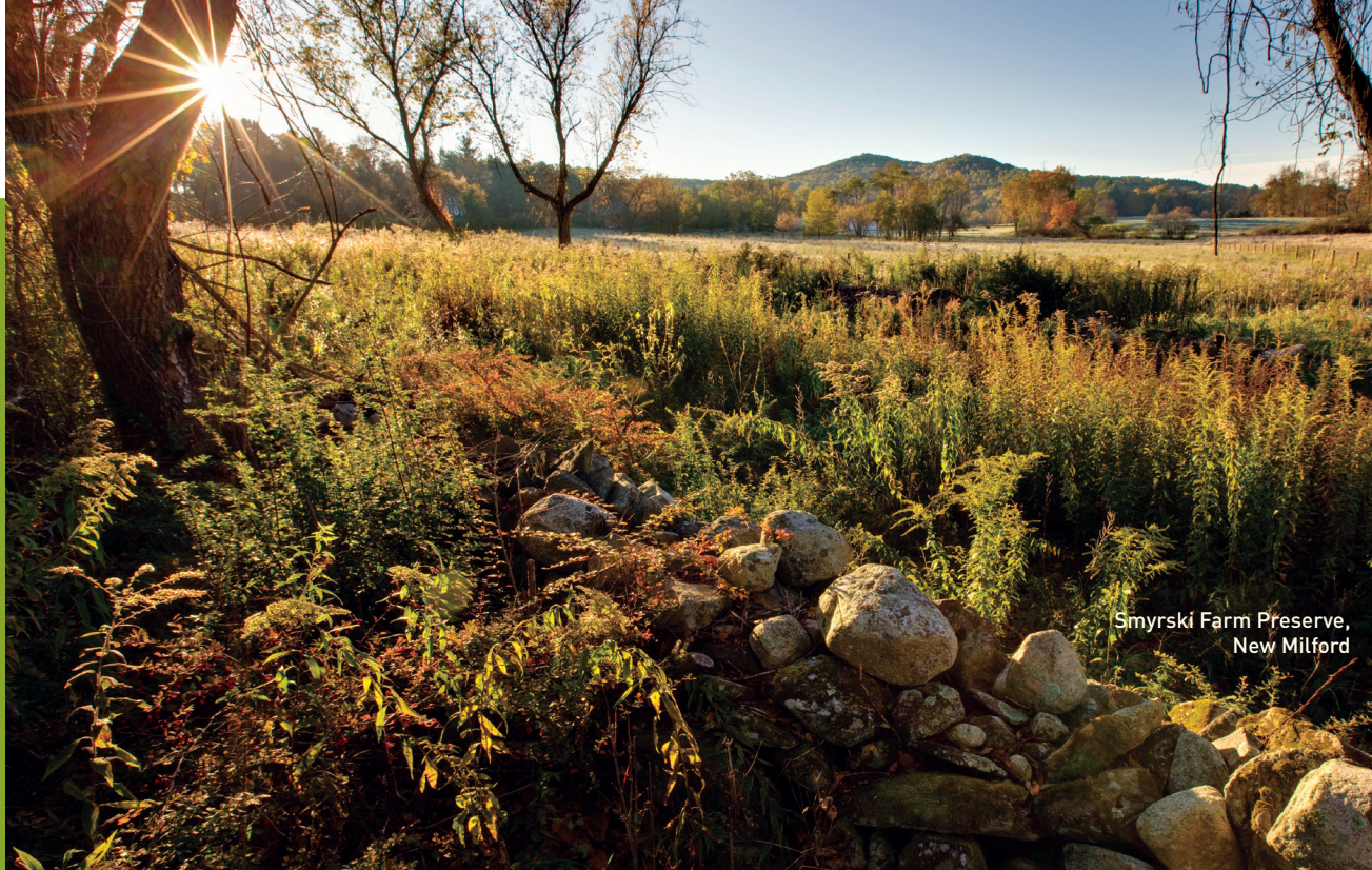
Smyrski Farm Preserve, New Milford