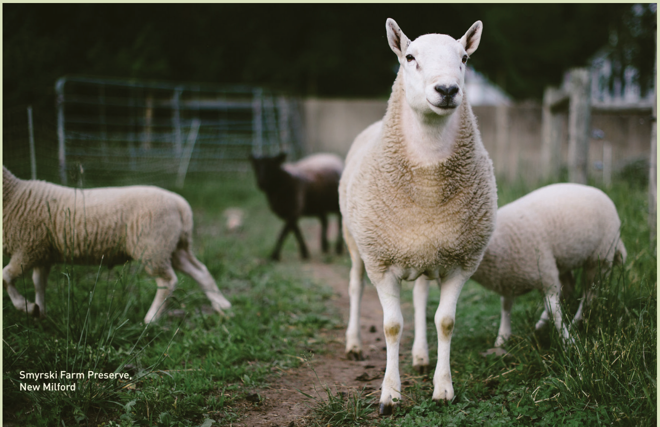
Smyrski Farm Preserve, New Milford

This list comprises of donations received between January 1, 2014 - December 31, 2014. If you feel an error or omission has occurred, please contact us.